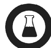
chemical waste tanks